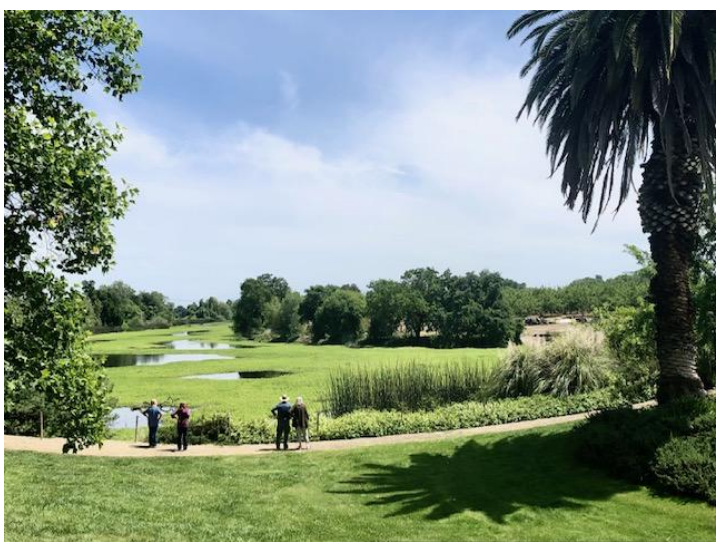
"As they cleared the land, Emile and Simone Furlan uncovered a small lake that has become the jewel of the property."