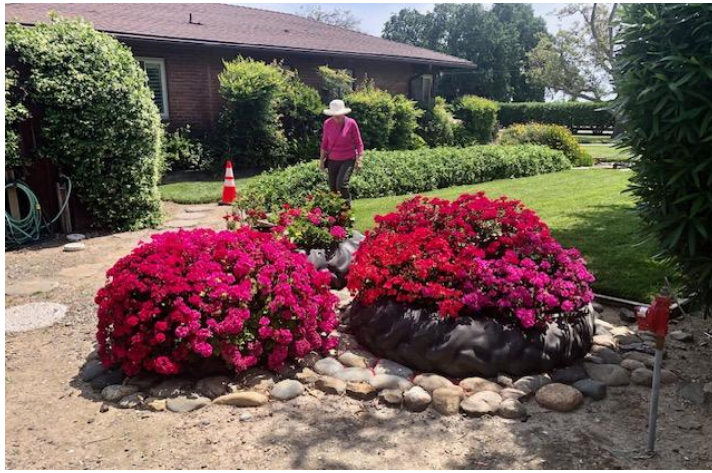
Clairelee grew these beautiful geraniums in tractor tires in her side yard.