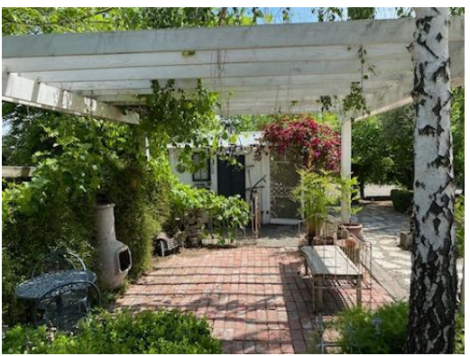
Nadine's beautifully secluded patio.