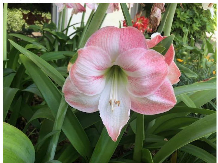
This is an amaryllis from Simone Furlan's beautiful large amaryllis display in her garden.