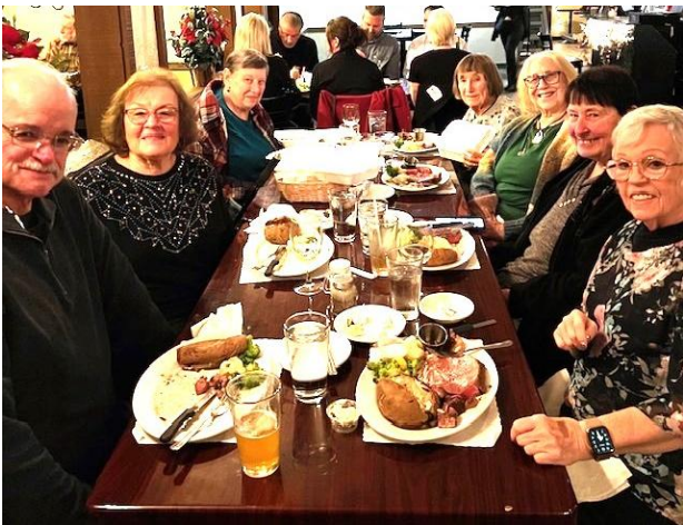
Here we are on New Year's Eve at The Ranch House in Yuba City.