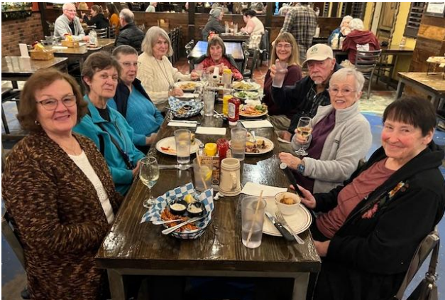
The All-Around Town dinner group were at Sutter Buttes Brewery on Jan. 8.

ALL AROUND TOWN - Dinner group normally meets on the 2 nd Wednesday of each month at 5:30 pm at a local restaurant. Contact Betty Bonner, 530-301-2265.