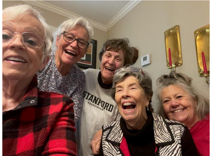
These are some of the Basket Elves.