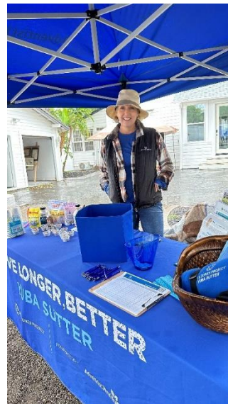
Thank you to Blue Zone for being a part of the Garden Tour reception held on the lawn of the McCampbell mansion.