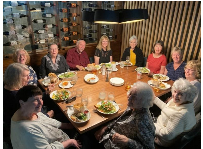
On April 25 we went to Bennett's in Sacramento.