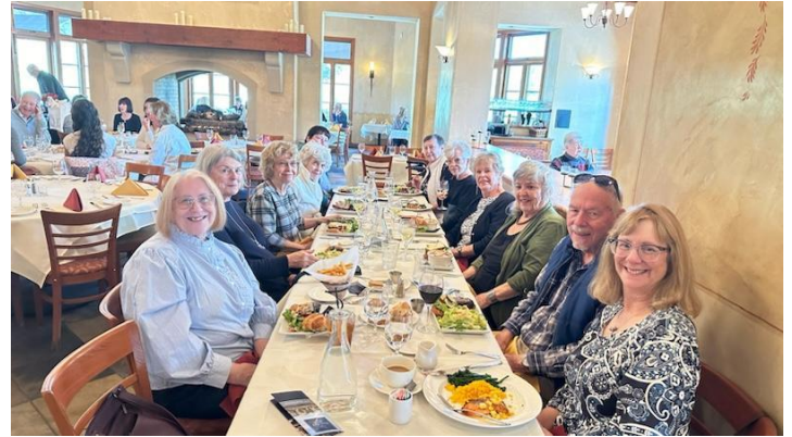
On March 28 the Traveling Gourmet went to La Provence in Roseville.