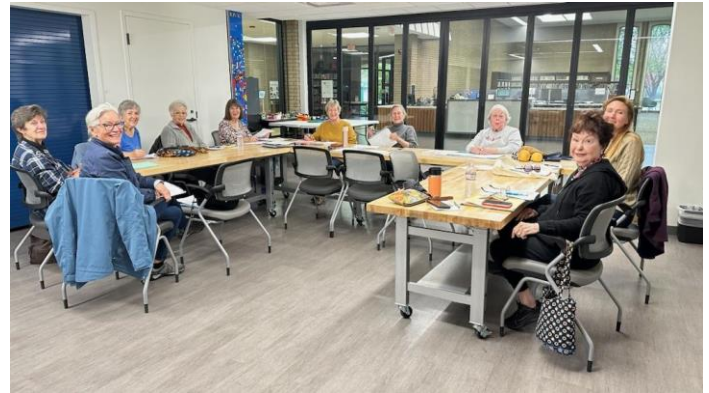
Garden Tour Committee at a planning meeting on April 4, 2024