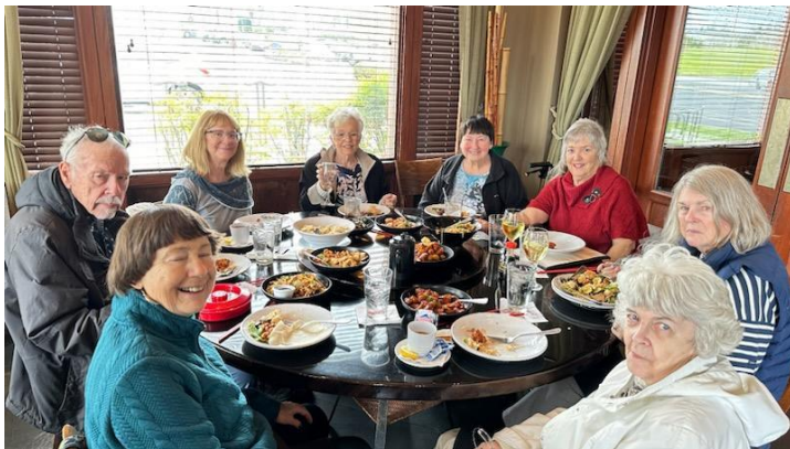
On Feb. 29 the Traveling Gourmet went to Fats Asian Bistro in Roseville.