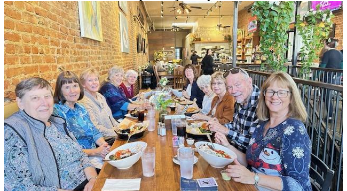
Traveling Gourmet went to the Clover Café in Oregon House in October. In November we went to The Union in Oroville.