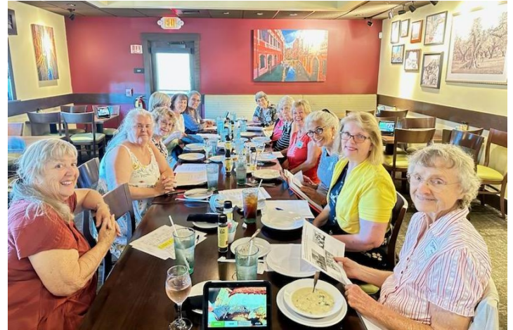
Interbranch Council (IBC) met in Yuba City at the Olive Garden on August 2 for dinner and sharing ideas. It was attended by all six AAUW branches who are in the Interbranch Council.