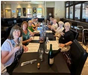
In July we went to Wine Villa in Lincoln.