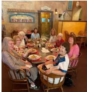
Grass Valley.