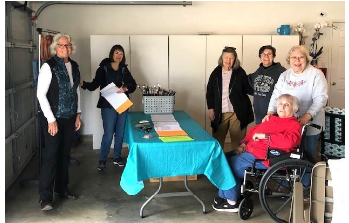
We got together to assemble Garden Tour hostess bags on May 1 in Joyce’s garage.