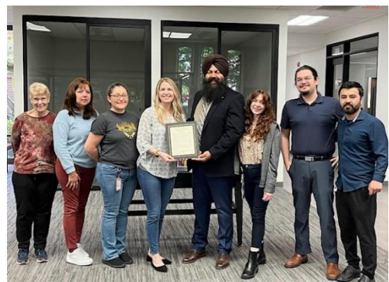
National Library Week was the end of April, and here is a picture of the Sutter County Library Staff on

Now that I am retired, I have been able to devote more time to my hobbies of playing piano, golfing, and reading. More importantly, I can now travel with my husband and spend time with our two grandsons in Virginia and our granddaughter in San Diego. This photo is of my grandsons who helped bake and decorate an Easter lamb cake. I look forward to becoming involved in AAUW. The organization's work to support young women with pursuing career goals, particularly in STEM fields is a very worthy endeavor and aligns with my interests.