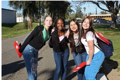
Here are 4 friends who posed for the camera.

The girls arrived from 25 different schools and made their way to the gym for the opening ceremonies before each girl went to her three sessions. The sessions were led by 21 working community women who use the STEM subjects in their careers.