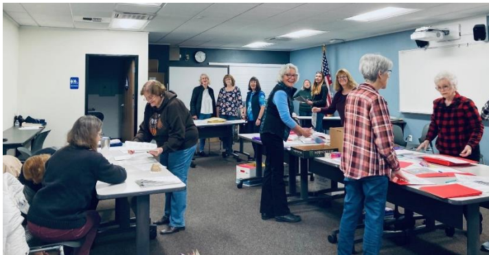
On March 21 more than a dozen of us worked to prepare the packets for the March 27 STEM Conference.