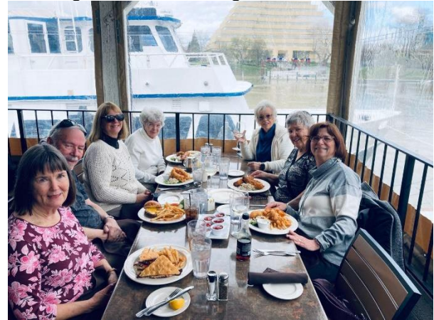
Here we are on March 23 at Rio City Sacramento. Do you see yourself in this picture?