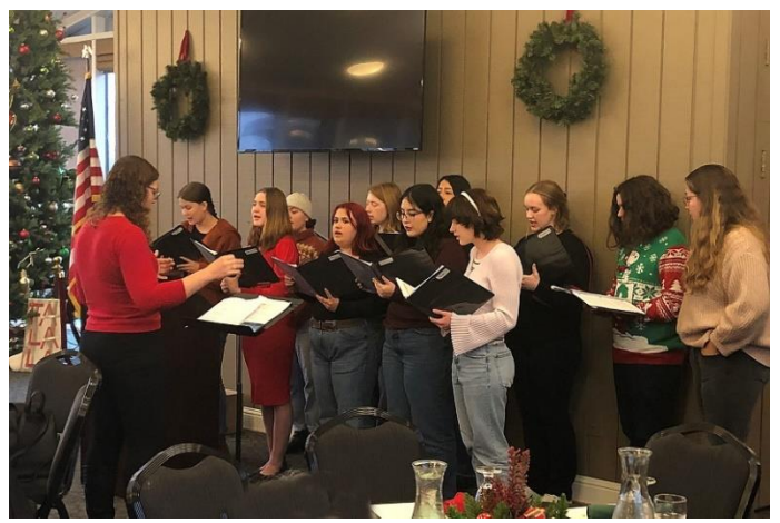
But before eating we listened to an outstanding performance by the Live Oak High School choir.