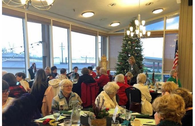
The room was beautifully decorated by the staff of the Peach Tree Country Club who also prepared our delicious brunch.