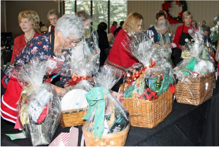
$800 was earned at the Coalition Brunch drawing.