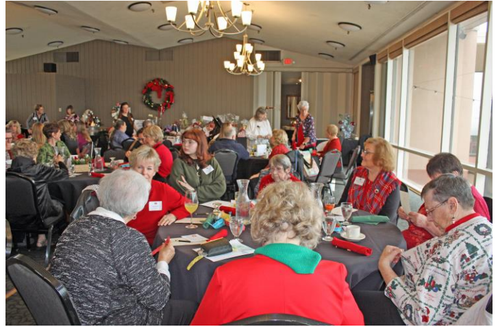
Good times were had by all!