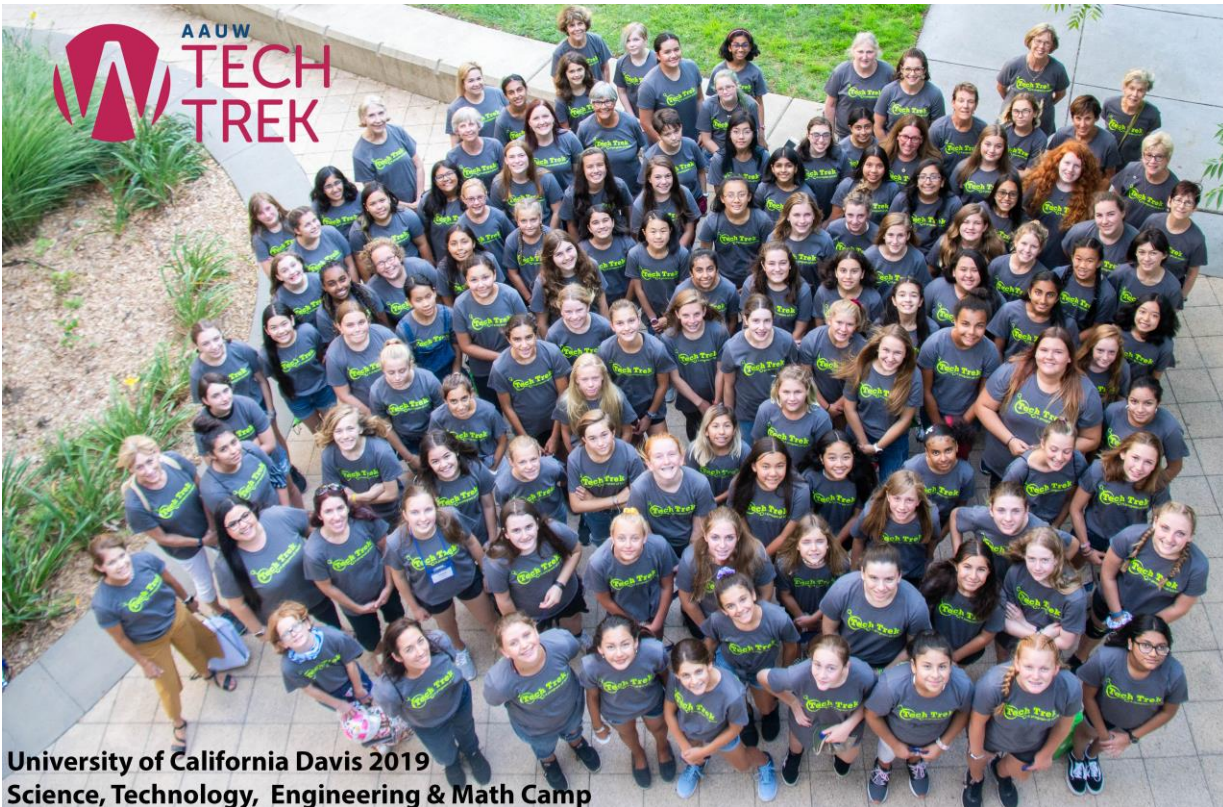
University of California Davis 2019 Science, Technology, Engineering & Math Camp