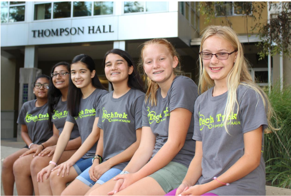
Here is the picture taken at camp of our 2019 Tech Trek scholars.