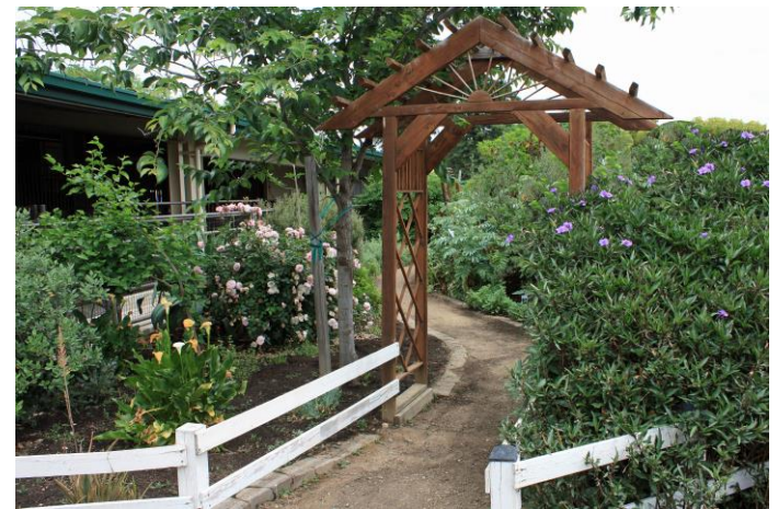
The Richcreek garden in downtown Marysville included meandering paths and detailed surprises along the way. The Marysville High School Ag Department Demonstration Garden featured plants native to America behind this beautiful entry arch. Plants were for sale in their two greenhouses, animals were in the barn, and students were showing their art projects for sale. Our afternoon Garden Tour reception took place just a short distance away.