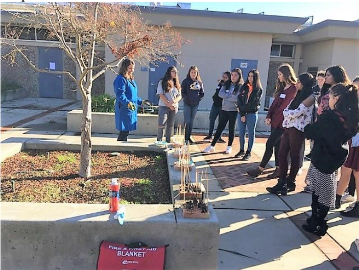
Above photo courtesy of Barbara Douyon