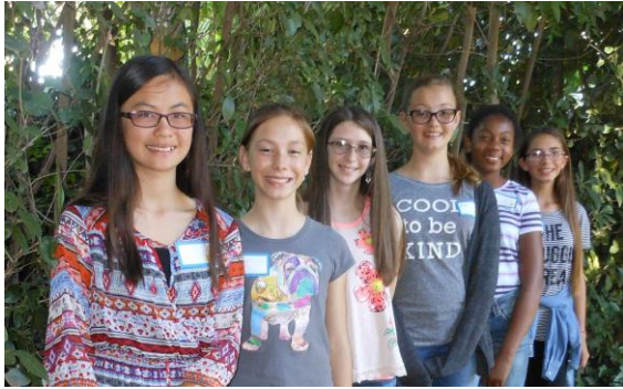
Each of our six 2016 Tech Trek winners sent thank you notes. Here are the final three letters for your enjoyment.