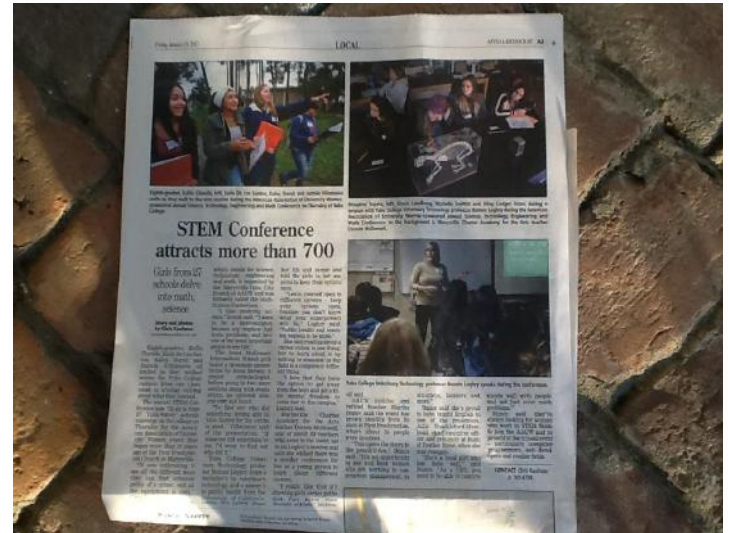
The Appeal Democrat ran this ½ page story on page 3 of the Jan. 13 paper.

732 eighth grade girls from 27 schools attended the January 12 th STEM Conference at Yuba College. Our AAUW branch has been putting on the STEM (Math-Science) Conference for 8 th grade girls once a year since the mid-1980s.