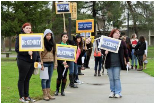
Editor's Choice, STEM